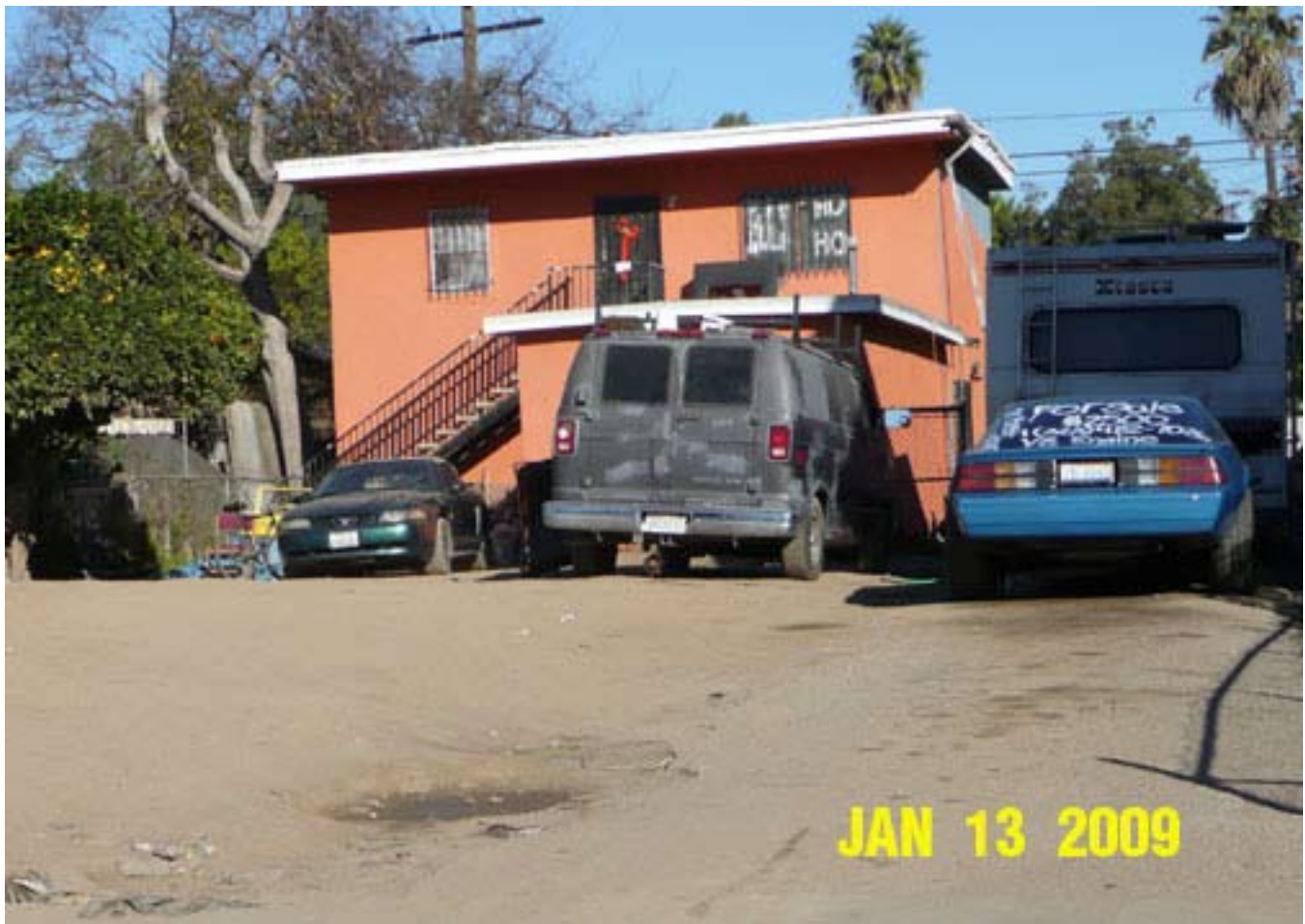
1921 W. 23rd Street.

Neighbors and police complain that people at this apparent duplex carry on an illegal car repair business. Put on our list in November 2006. Photo as of January 13, 2009. Unusually deep front yard, all dirt, used to park vehicles. Numerous vehicles were impounded in the spring of 2007. In observations of July 5 and 15, August 20, and September 2 and 30, 2008, two cars were parked in front yard. At the Sept. 18, 2008, public safety committee meeting it was reported that there has been a drug arrest at this location. Was referred to the Problem Property Resolution Team. There was another drug bust at this location on January 8, 2009, in which five persons were arrested and the children living there were removed from the property. Two vehicles were parked on dirt off driveway on May 4, 2009 but front yard was clear in observation of July 7. We filed a new Housing complaint May 20, 2009, for parking in the front yard. There were two cars in the yard that day. New case number 249615. Deputy City Attorney Rebecca Gardner has filed a vacate case against the person in the house involved in a drug arrest at that location.